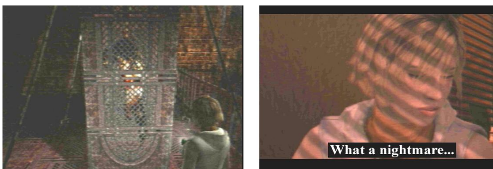
Figure 1: Heather's nightmare.

Silent Hill 3 is a survival horror game, where Heather, the player character, finds herself trapped in a nightmarish world. In the game Heather is seen in third-person perspective.