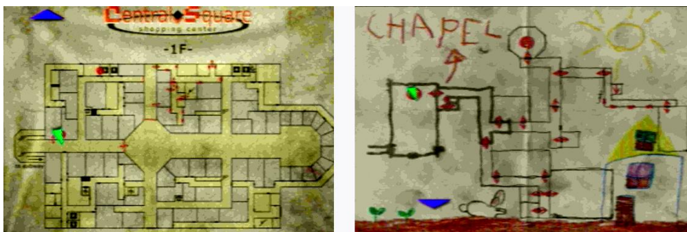
Figure 4: The map on the left hand side shows the style of maps used before last section of the game. At the middle of last section map changes to child's drawing (on the right hand side)

Later on in the game, a player is taken to Heather's home. Her room gives some hints about what Heather is like (being ordinary girl) – in a similar way as how seeing someone's home, their cloths, jewelry etc. feeds information about that person [12]. Information about spaces is also conveyed to players by using predefined functions (written monologue): Heather tells a player about rooms and about the memories they bring back of her childhood. Items also serve as a way to describe Heather. A player can for example find diaries or notebooks of various characters that reveal some aspects or views about Heather's past.