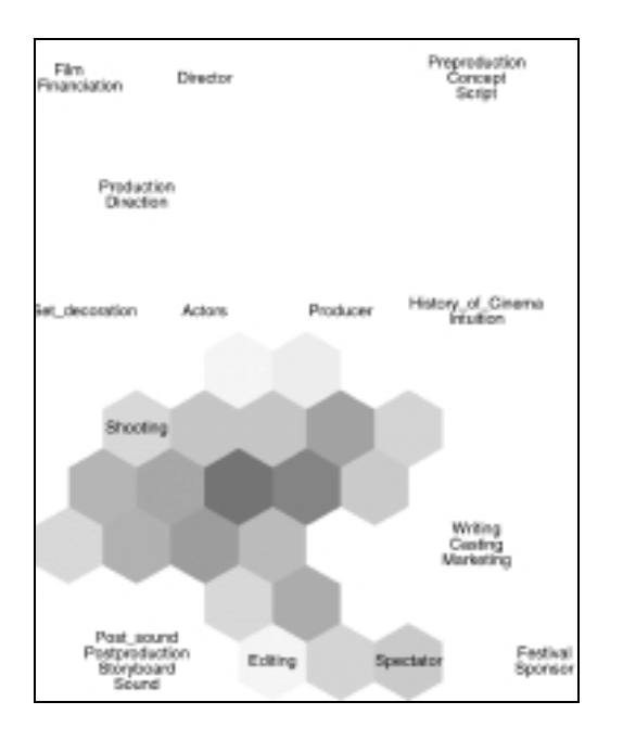
Figure 1. A map of cinematographic concepts based on input by a first year student.

A map based on first year film student's answers was also created (see Figure. 1). First, he was asked to draw a mind-map about the concept "film". Second, those 25 concepts were collected from the mind map. The student was asked to provide values according the method explained earlier in this article. The result gives a picture how the student has conceptualized the filmmaking process in his studies. A related webbased environment on filmmaking is accessible at the site http://www.mlab.uiah.fi/elokuvantaju/